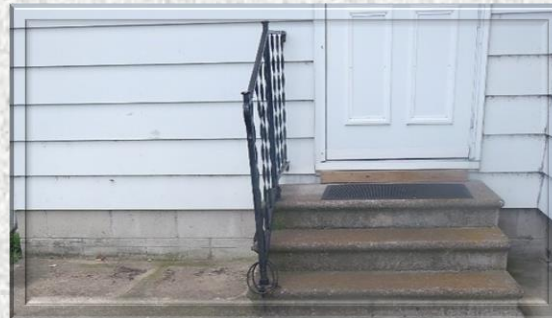
Before ^ After