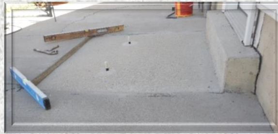
Before ^ After